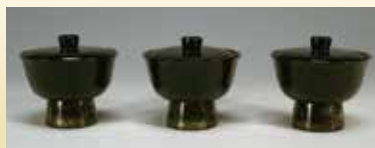
MATSUDA Gonroku, Bowls with design of stream in maki-e

The venue is Ishikawa Prefectural Museum of Art.