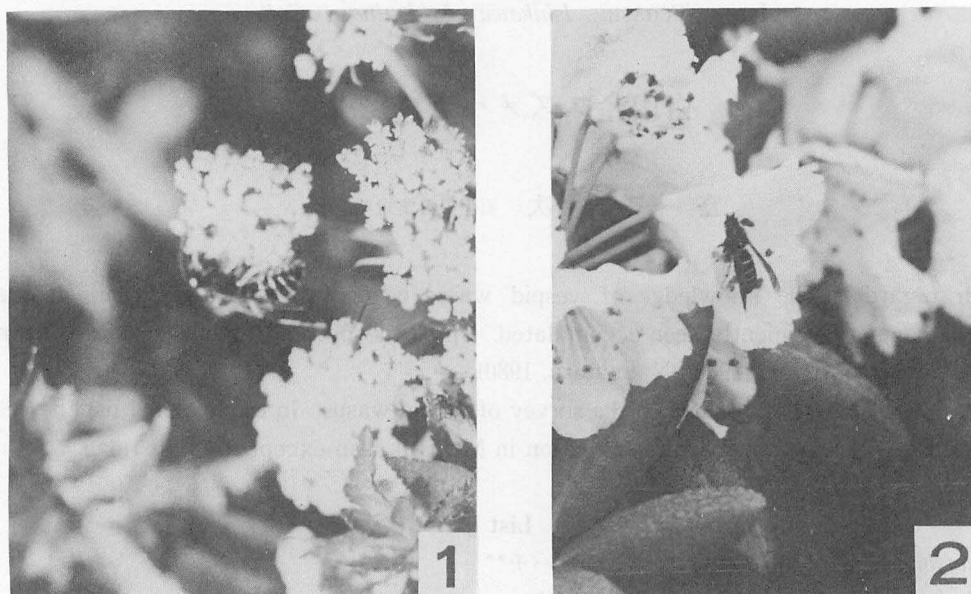
Figs. 1 and 2. Vespid wasp, Dolichovespula pacifica Birila. , visiting flowers. 1, Flower of Angelica ursina ; 2, flower of Rhododendron fauriae .

This species visited on flowers of Angelica ursina Maximowicz and Rhododendron brachycarpum D. Don in the subalpine region in Mt. Hakusan.